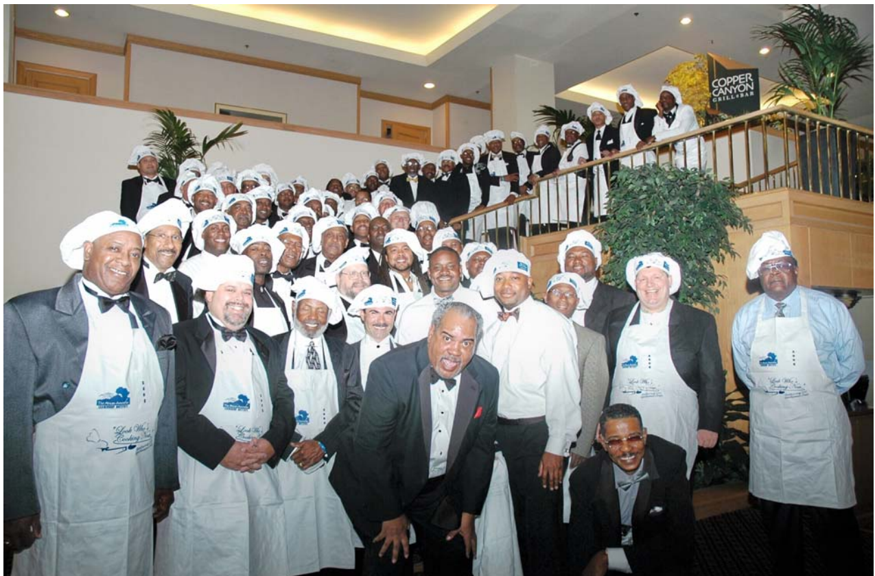
2005 Look Who's Cooking Now Chefs – Renaissance Denver Hotel