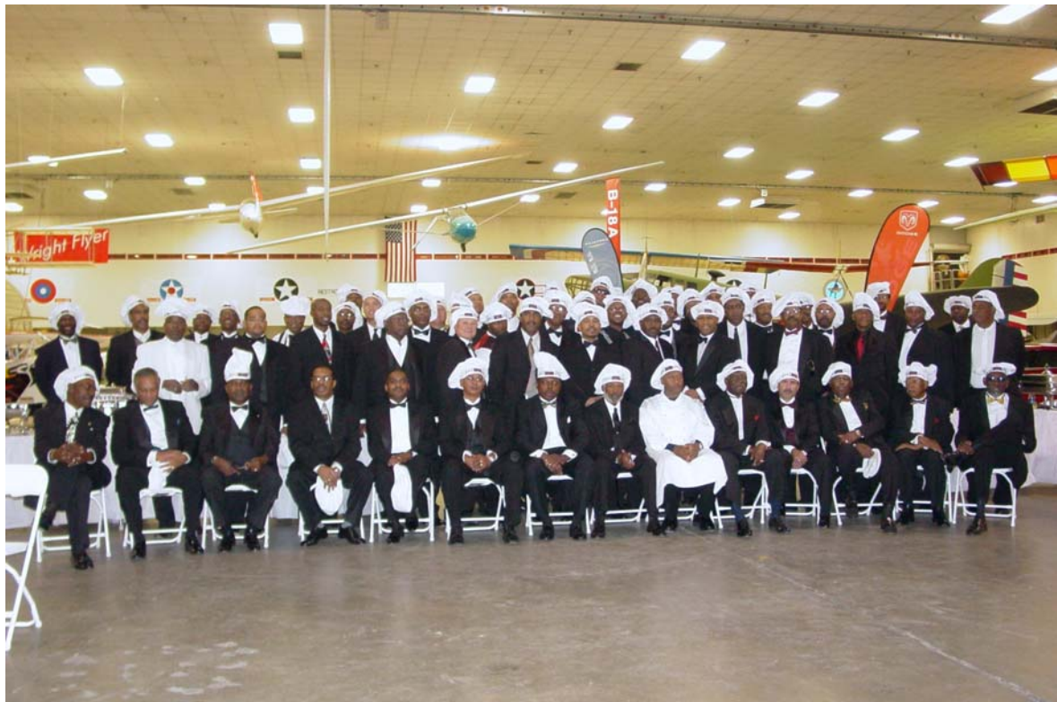
2004 Look Who's Cooking Now Chefs – Wings Over the Rockies Flight Museum